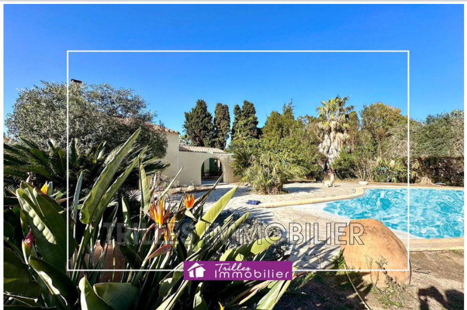
Villa 1351 Perpignan

Saint-Jacques Garden Come and discover this magnificent 4-sided villa with swimming pool, independent studio and its large double garage!!! This splendid villa offers you an outdoor space hidden from view, perfect for relaxing and enjoying the sun in complete tranquility. Inside, you will immediately be seduced by a bright and spacious living room, with superb ceiling height and exposed beams which add incredible charm. The fully equipped kitchen is a real pleasure for cooking enthusiasts, with its ample storage and generous space. On the ground floor you will find two comfortable bedrooms which open directly onto the outdoor patio, ideal for enjoying a morning coffee or relaxing at the end of the day. A beautiful bathroom with double sink unit, walk-in shower and plenty of storage completes this space. Upstairs, a third bedroom is located on the mezzanine, offering a breathtaking view of the living room. You can enjoy moments of tranquility and relaxation in this spacious room. The exterior of the villa is just magnificent!!! The unobstructed garden is a true corner of paradise, with a terrace sheltered from the wind where you can relax and enjoy outdoor meals. The pool is simply amazing! You can cool off or just take a swim during the hot summer days. It's the