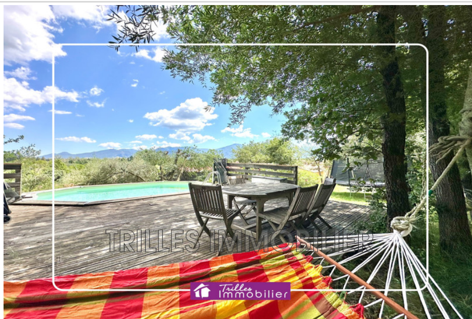
Villa 1462 Ortaffa

FAVORITE – 3-sided villa with a main house + two independent apartments built on a plot of 5,440 m² of land. Looking for an exceptional place to live, combining comfort, nature, and profitability? This unique property, nestled in the heart of nature on a 5,440 m² plot, is much more than a home: it's a true slice of paradise. The main residence: Upon entering, you will be charmed by a spacious and bright living room, enhanced by high ceilings and a warm atmosphere, giving access to a beautiful green terrace with its 5-seater jacuzzi. The open kitchen allows you to stay connected to your family or guests, while enjoying a pleasant conviviality. On the night side you will find 3 spacious bedrooms with wardrobes, a bathroom with walk-in shower and a separate toilet. Upstairs, a closed mezzanine can accommodate a 4th bedroom, an office or a games room. ✓ Ducted air conditioning throughout the house ✓ Terrace without vis-à-vis with 5-seater heated jacuzzi ✓ Large wooded garden, in absolute calm ✓ Swimming pool with breathtaking views of the mountains and the Albères ✓ Garage with electric door and workshop for DIY or storage A peaceful environment, protected by nature, perfect for recharging your batteries every day. □ Two independent apartments –